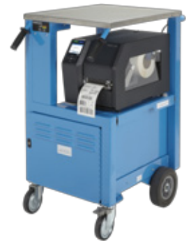
Powered Mobile Print Cart