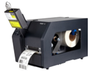
Online Data Validator (ODV)